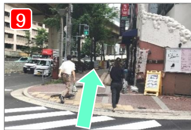
Walk north along the sidewalk on Shin Midousuji.