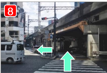
Cross the pedestrian crossing and turn left.