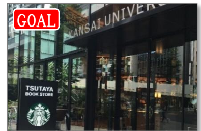
After about 30 meters, you will see a black building with “Starbucks Coffee” sign on your right. This is the building of Kansai University’s Umeda Campus, called “KANDAI Me RISE”.